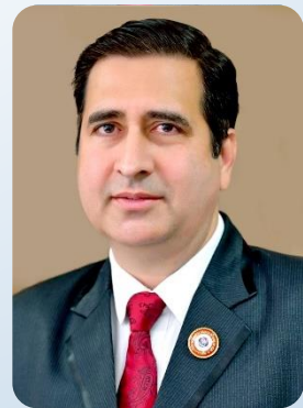
Immediate Past Chairman