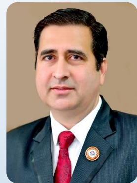
Immediate Past Chairman