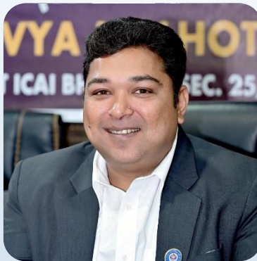
NICASA (Panipat) Chairman