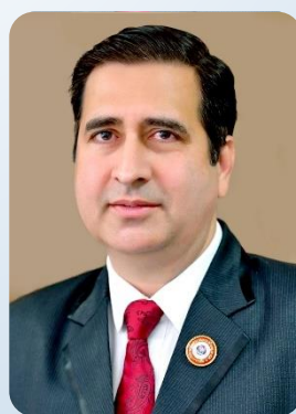
Immediate Past Chairman