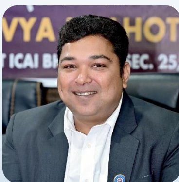
NICASA (Panipat) Chairman